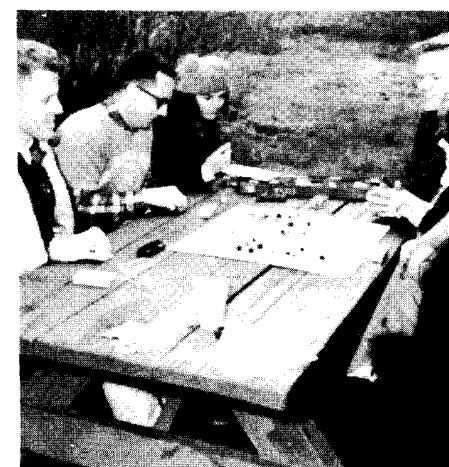
Kilburn — Ambassador College Photo

Scenes from a mountain outing — a good way to enjoy the good life, and no hangovers afterward.